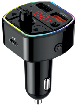
MT 2 L

Thanks for choosing our products. This device will transmit your phone call and music to your Car Stereo system by FM transmission. The echo cancellation and noise suppression technology provide the Hi-fi sound quality; bringing you excellent sound experience. USB ports provide QC3.0 output and PD 20W, charge your mobile devices quickly while driving. This device supports RGB color light mode, cool light making your night different.